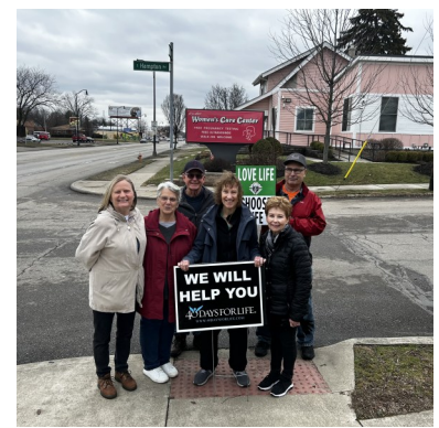
Thursday Turn Away Team!

Scan the QR code or visit gertl.org/40-days-for-life to learn more or adopt a day or hour!